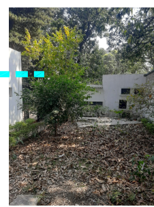
COURT - SIDE - EXISTING