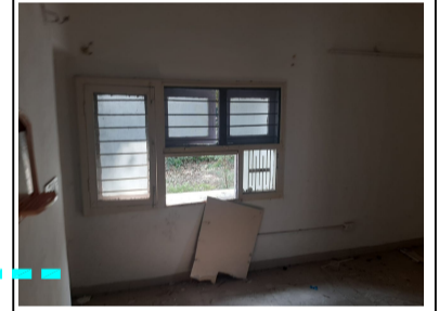
BED ROOM - 1 - EXISTING