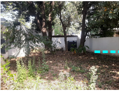
COURT - REAR - EXISTING