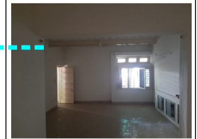
DRG. ROOM - EXISTING