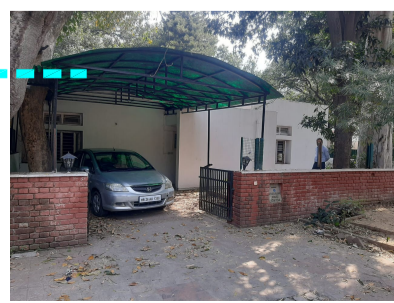
COURT - FRONT - EXISTING