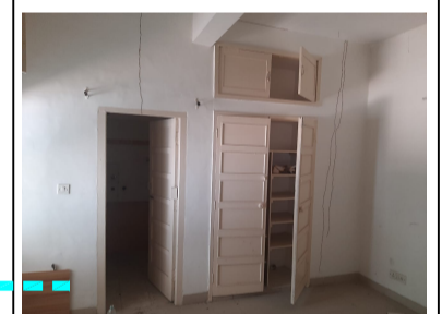
BED ROOM - 2 - EXISTING