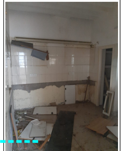
KITCHEN - EXISTING