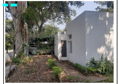
COURT - FRONT - EXISTING