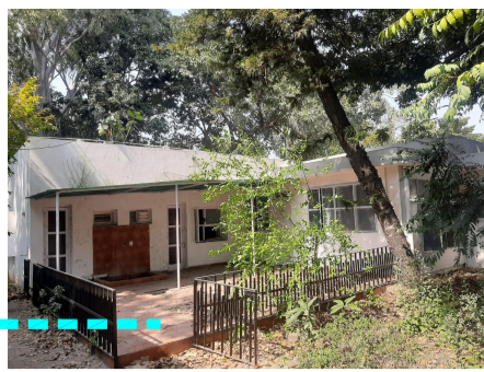
VERANDAH / COURT - REAR - EXISTING